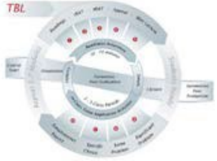
Team-based learning methodology by Jim Sibley and Sophie Spiridonoff, University of British Columbia

1. Students start the readiness assurance process by studying materials suggested by the instructor before class (Step 1, in red above) to cover the basic facts, concepts and vocabulary necessary to discuss the topic. This may involve reading assignments, taped lectures, practice-problems, pre-class learning so objectives and other self-study activities.